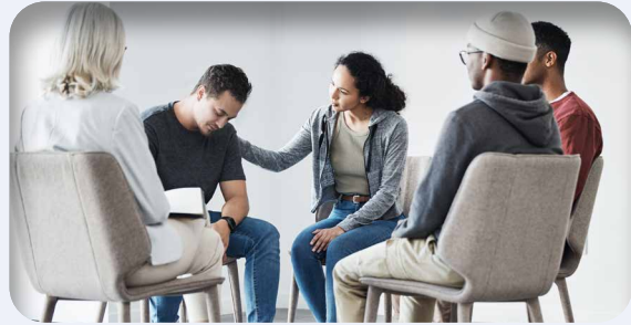
Addiction Recovery Centers