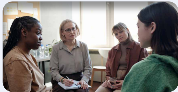
Crisis Pregnancy Centers