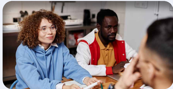
Anywhere There is a Need